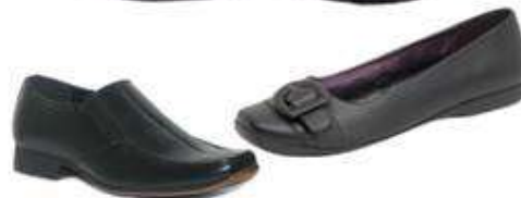
Plain black shoes (Plain black trainers are permitted)