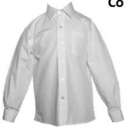
White collared shirt