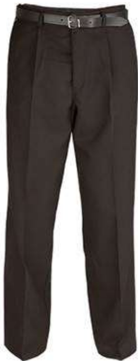
Boys black trousers