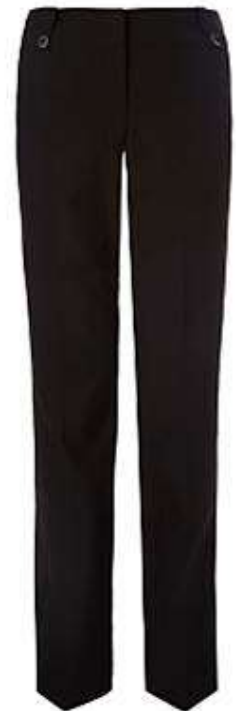
Girls black trousers