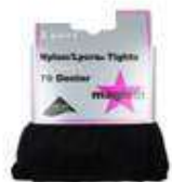
Black or grey tights