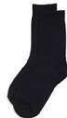
Black, grey or white socks