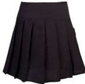
Girls black skirt / Boys black shorts