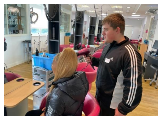
Hair & beauty